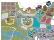
Greenfalls, Group 1